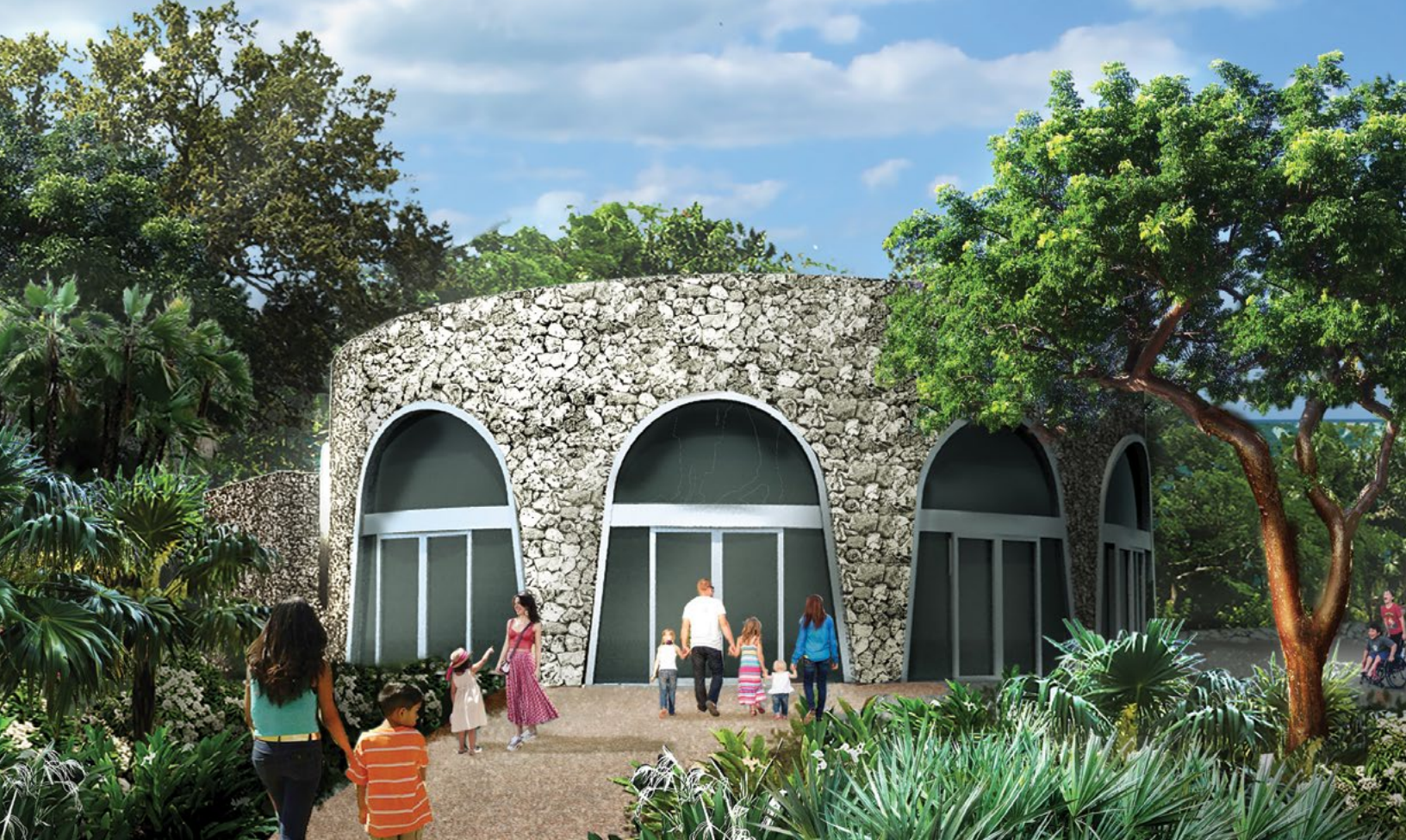
Inspiration Center Concept